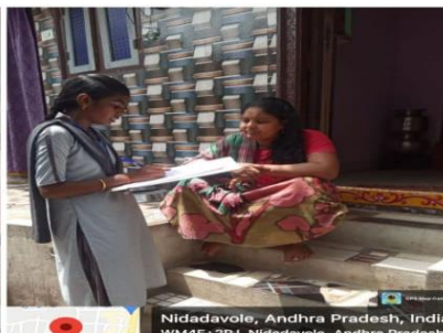
Nidadavole, Andhra Pradesh, India WM4F+2PJ, Nidadavole, Andhra Pradesh 534301, India Lat 16.904807° Long 81.67442° 02/06/22 10:30 AM