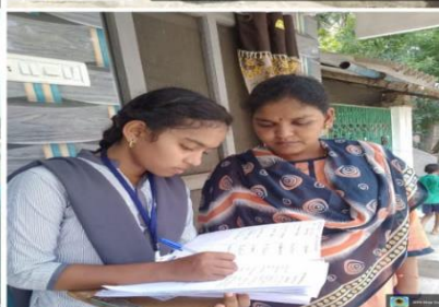
Munipalli, Andhra Pradesh, India Unnamed Road, Munipalli, Andhra Pradesh 534329, India Lat 16.857655° Long 81.711855° 02/06/22 12:15 PM