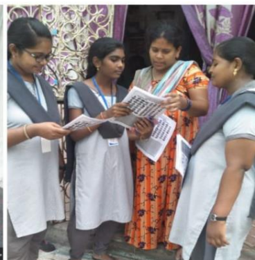
Nidadavole, Andhra Pradesh, India WM4F+2MP, Nidadavole, Andhra Pradesh 534301, India Lat 16.904685° Long 81.67387° 07/06/22 12:54 PM