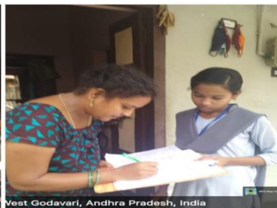
Vest Godavari, Andhra Pradesh, India Jnnamed Road, Andhra Pradesh 534301, India at 16.903691° ong 81.629367° 02/06/22 11:06 AM