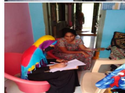
Nidadavole, Andhra Pradesh, India psatimed, Sarathi Nagar, Nidadavole, Andhra Pradesh 534301, India Lat 16.909313° Long 81.667745° 02/06/22 11:13 AM