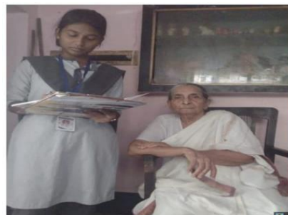
Nidadavole, Andhra Pradesh, India WM4F+2PJ, Nidadavole, Andhra Pradesh 534301, India Lat 16.904807° Long 81.67442° 02/06/22 10:30 AM