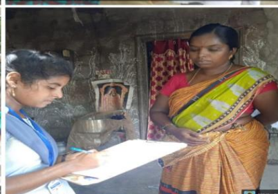
Kalavacherla, Andhra Pradesh, India VPH5+Q7B, Kalavacherla, Andhra Pradesh 534302, India Lat 16.879639° Long 81.708198° 02/06/22 11:22 AM