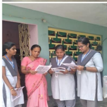
Nidadavole, Andhra Pradesh, India WM5C+G87, Santhi Nagar, Nidadavole, Andhra Pradesh 534301, India Lat 16.908603° Long 81.670407° 07/06/22 12:33 PM