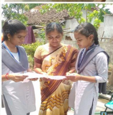
Munipalli, Andhra Pradesh, India VP37+P49, Munipalli, Andhra Pradesh 534329, India Lat 16.854808° Long 81.713191° 07/06/22 12:20 PM