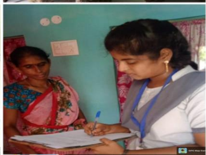
Kalavacherla, Andhra Pradesh, India VPH5+XJJ, Kalavacherla, Andhra Pradesh 534302, India Lat 16.879674° Long 81.708814° 02/06/22 11:16 AM