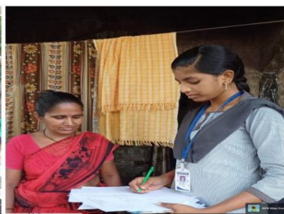
Madduru, Andhra Pradesh, India WPJ5+JQ3, Madduru, Andhra Pradesh 534302, India Lat 16.931591° Long 81.709616° 02/06/22 12:13 PM