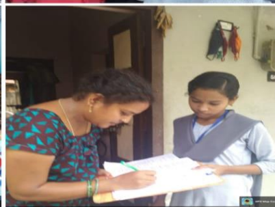
Vest Godavari, Andhra Pradesh, India Jnnamed Road, Andhra Pradesh 534301, India at 16.903691° ong 81.629367° 02/06/22 11:06 AM