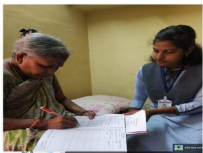
Nidadavole, Andhra Pradesh, India WM4G+RGH, Main Rd, Nidadavole, Andhra Pradesh 534301, India Lat 16.907069° Long 81.67627° 02/06/22 12:03 PM