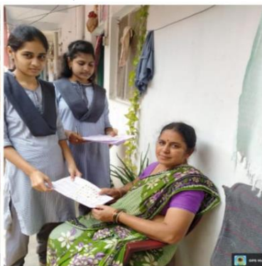
Nidadavole, Andhra Pradesh, India WMF+8RH, Nidadavole, Andhra Pradesh 534301, India Lat 16.906442° Long 81.674459° 07/06/22 01:08 AM