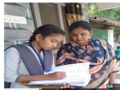
Munipalli, Andhra Pradesh, India Unnamed Road, Munipalli, Andhra Pradesh 534329, India Lat 16.857655° Long 81.711855° 02/06/22 12:15 PM