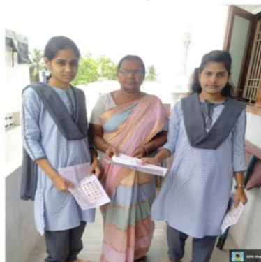
Nidadavole, Andhra Pradesh, India 6-6, Big Mosque St, Nidadavole, Andhra Pradesh 534301, India Lat 16.906033° Long 81.674128° 07/06/22 11:50 AM