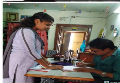
Nidadavole, Andhra Pradesh, India 6-6, Big Mosque St, Nidadavole, Andhra Pradesh 534301, India Lat 16.904807° Long 81.67442° 02/06/22 11:56 AM