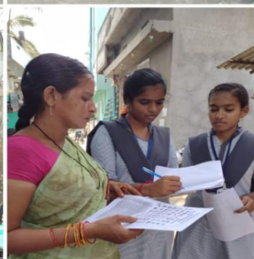
Munipalli, Andhra Pradesh, India VP47+RQ9, SH 22, Munipalli, Andhra Pradesh 534329, India Lat 16.857486° Long 81.713326° 07/06/22 11:50 AM